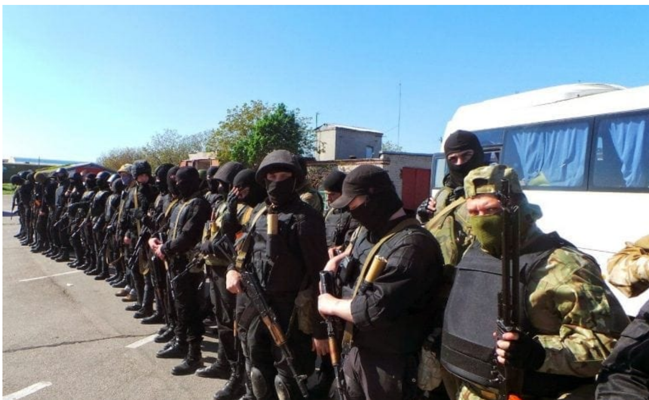
Azovs at a staging point prior to deployment.

I was recently speaking with a friend, a soldier in the NAF who fought at Debalsevo. He told me that during the battle, he came across a wounded Pravy Sektor Nazi with swastika tattoos and a shirt that had “Мастер”, “Master”, emblazoned across the front. The “Master” was begging for mercy. My friend finished him off, and I would have done the same. Do you think that is bad? Well, if you have been in battle against Nazis, you are entitled to an opinion about it. If you haven’t, then you’re not. Either way, read the rest of this article before you decide.