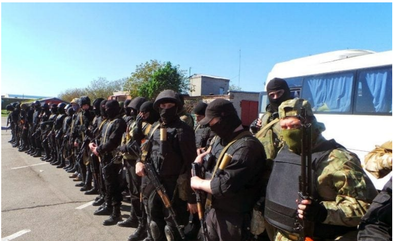
Azovs at a staging point prior to deployment.

I was recently speaking with a friend, a soldier in the NAF who fought at Debalsevo. He told me that during the battle, he came across a wounded Pravy Sektor Nazi with swastika tattoos and a shirt that had “Мастер”, “Master”, emblazoned across the front. The “Master” was begging for mercy. My friend finished him off, and I would have done the same. Do you think that is bad? Well, if you have been in battle against Nazis, you are entitled to an opinion about it. If you haven't, then you're not. Either way, read the rest of this article before you decide.