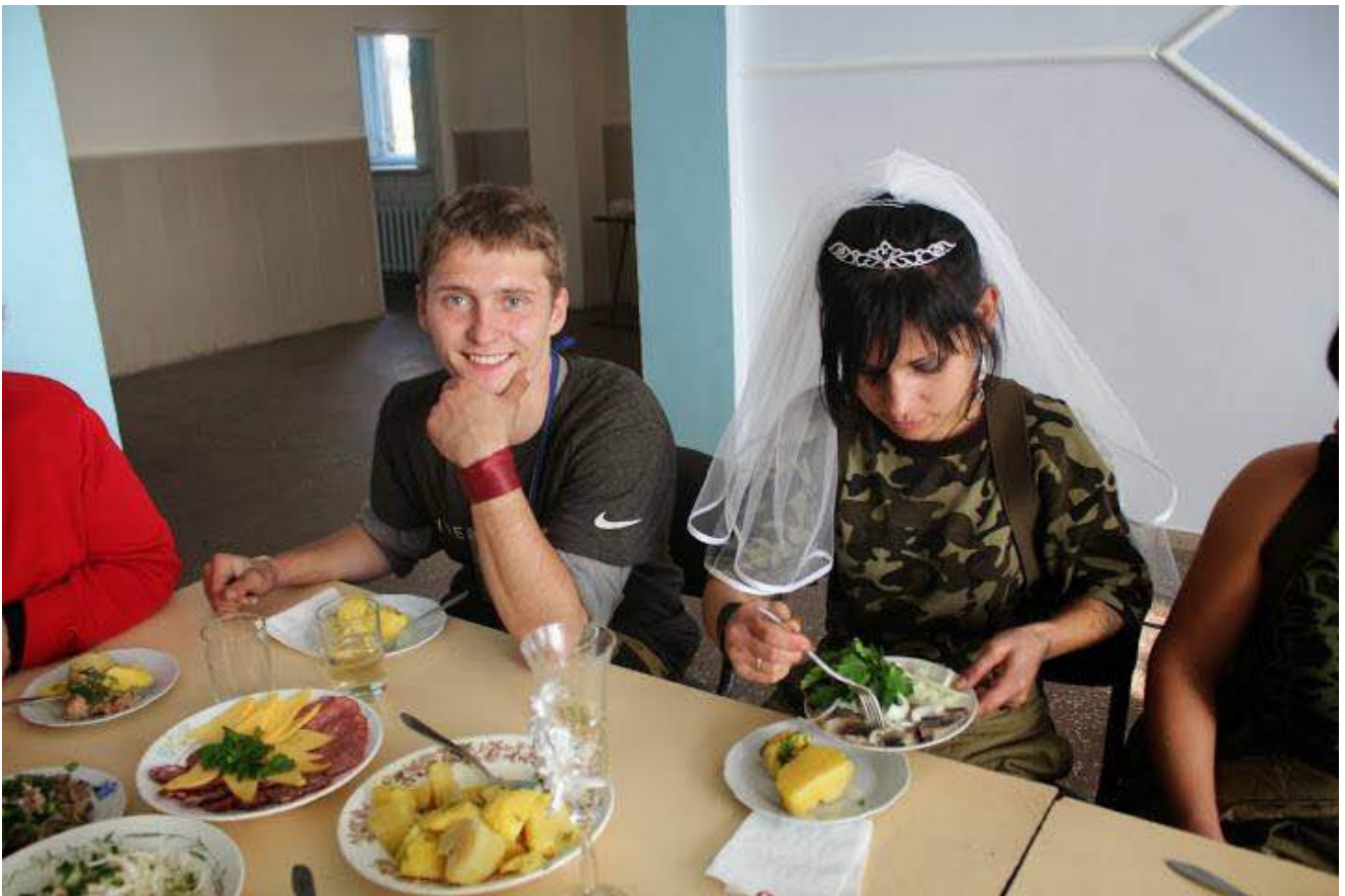
Married to Julia in 2014

Nothing extravagant, nothing grotesquely excessive. But touching in their honesty, comradeship and simplicity. What a contrast with the decadent West.