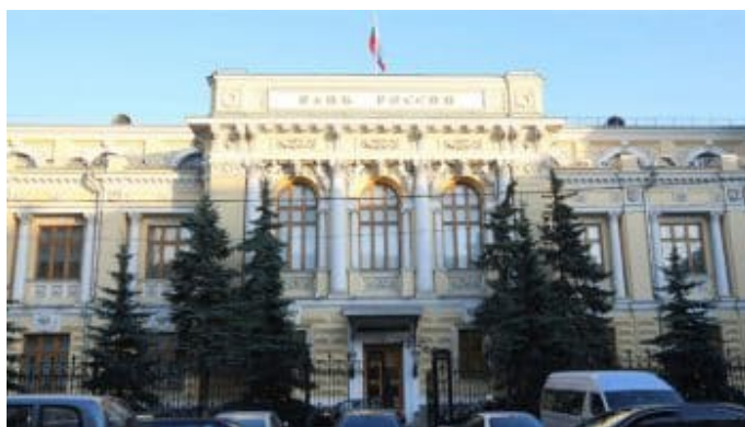
Controllers bearing gifts: The Central Bank of Russia

This is exactly what the Controllers accomplished, taking control of Russia's Central bank. From that point to the present day, Russia's boasted independence has been a mere phantom.