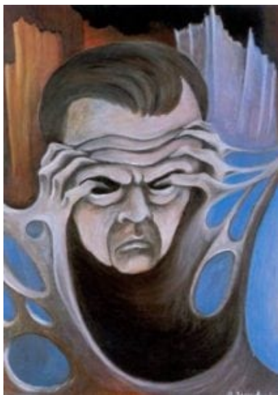
Alexander Zinoviev’s Self-Portrait: Thinking is Painful.

We shall shortly see that the Controllers have, over the past three centuries or so, made enormous strides: they have