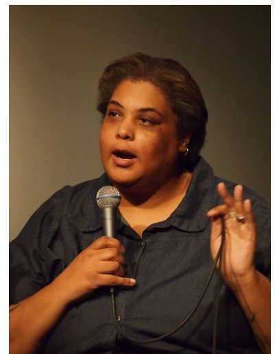
Roxane Gay

Olivia Goldhill headlined her piece at Quartz , “Naming abusers online may be ‘mob justice’ but it’s still justice.” Goldhill doesn’t seem to get the point of the phrase “mob justice,” i.e., that it is no justice at all.