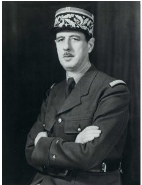
De Gaulle during World War II, in his uniform of Général de Brigade

Can we seriously imagine de Gaulle accepting directions from hawks in Washington which were clearly injurious to the economic interests of his country? If the Americans had threatened to impose secondary sanctions on French companies for doing business with Iran in the General's time, he would have taken the next flight to Tehran with French business leaders to set up new deals. He'd have done the same regarding the sanctions on Russia. That's how he responded to those who tried to get him to act against France's national interests.