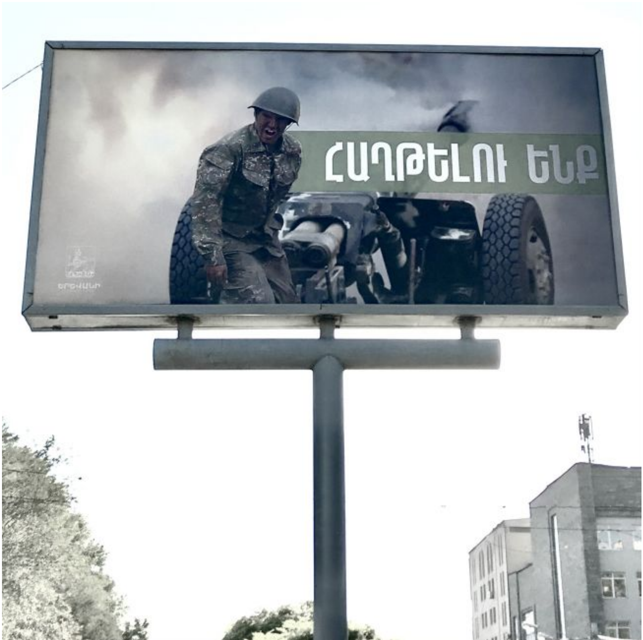
Digital billboard in Yerevan (Armenia) displaying images of the war.

In the final week of September, an Azerbaijani offensive renewed hostilities in the perennial armed conflict and territorial dispute in the South Caucasus between Armenia and its neighbor over the Nagorno-Karabakh (“Mountainous Karabakh”) region. By October, the clashes had escalated past the state border between Azerbaijan and the internationally-unrecognized Republic of Artsakh which suffered heavy shelling from banned Israeli-made cluster bombs by the Azeris.