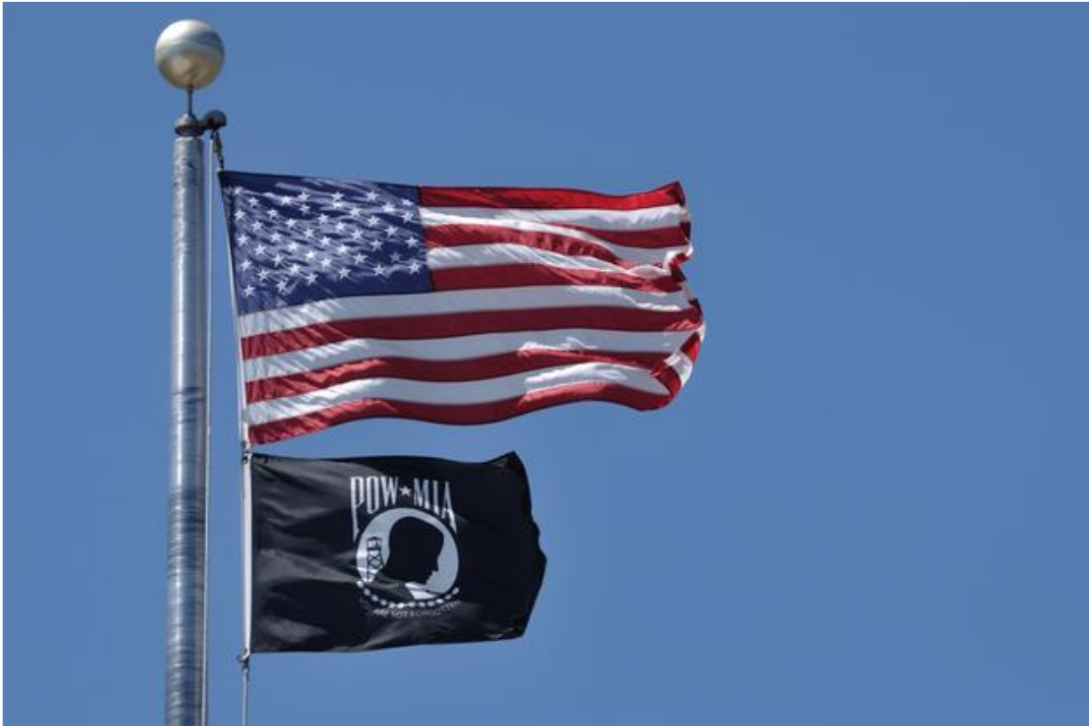
The U.S. flag flies above the POW/MIA flag. 24 Oct 2019

A bipartisan bill –the National POW/MIA Act, introduced in the Senate by Sen. Elizabeth Warren, D-MA, requires the POW/MIA flag to be flown with the American flag at certain memorials and federal buildings, including the White House and the U.S. Capitol, to honor unaccounted for servicemen and servicewomen from across more than 50 years of wars and conflicts.