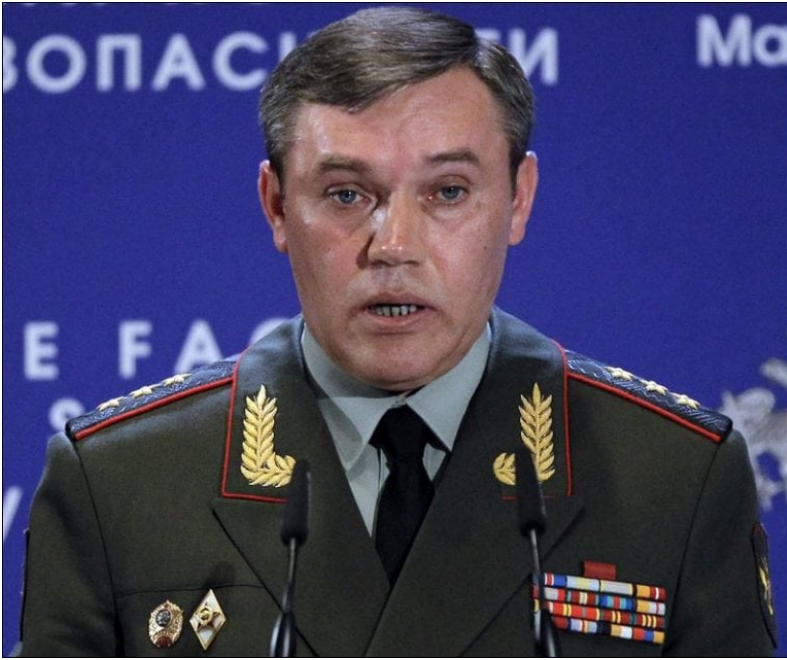
Russia's Gen. Gerasimov

“Well, the Americans should have thought about that before providing nuclear submarines to Australia, and pissing Macron off in the process,” countered Gerasimov.