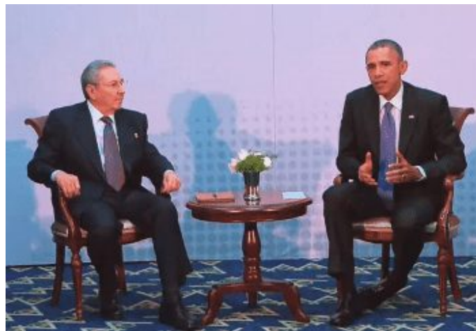
President Obama meets with President Raul Castro in Cuba.

[dropcap]P[/dropcap]resident Barack Obama's recent visit to Cuba has been roundly condemned by his right-wing opponents. The fact that the visit coincided with the Brussels bombing has not been omitted from conservative diatribes.